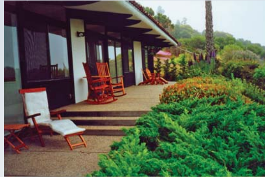
Oceanaire – Rancho Palos Verdes

Joint Commission's Gold Seal of Approval